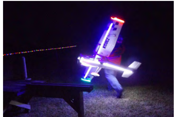
Patrick heading to the runway