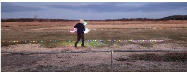
Dave about to fly at dusk