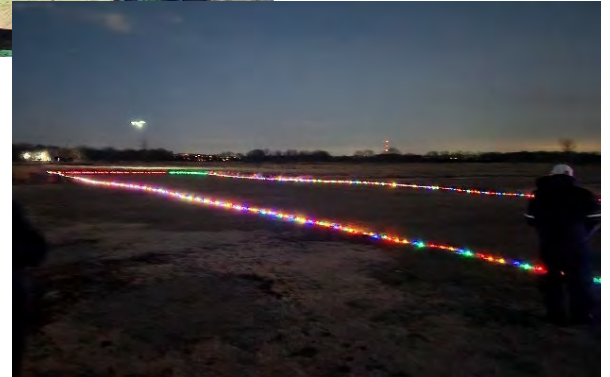
Dave and George flew on into full dark with a few spectators (and some daytime-only JMMers).