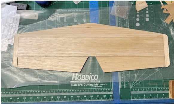
Stabilizer, elevator, and fuselage pieces cut.