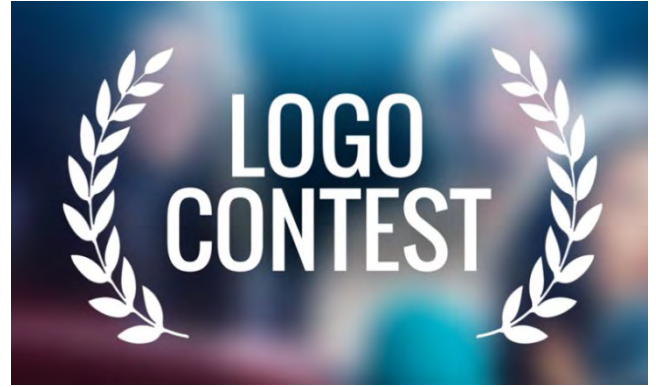
Still waiting on more logo designs

The voting on runway paving is in a dead heat with equal amounts of club members voting for option 1 as did for option 2. But I will continue to look for financial help, an idea that most of our members can stomach and permission to do so. Otherwise, everyone needs to ask Santa for an asphalt runway.