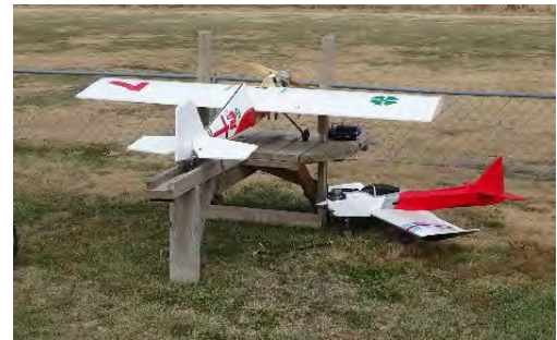
In spite of winds 20 mph