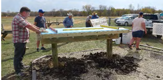
Getting the tables level was challenging!