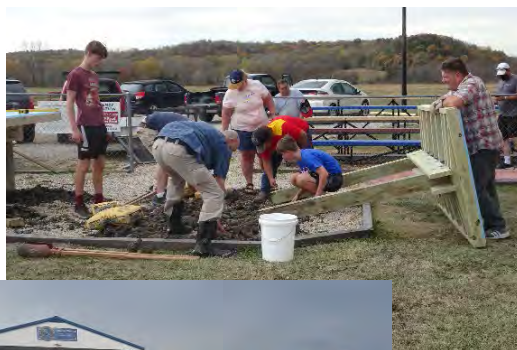
Setting the second table in place. (Note angry clouds to the northwest! Some sprinkles, most of the rain bypassed the field.)