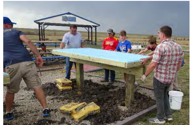
Second table in place and being leveled. (This was after being stood up, pulled out, rotated 180° and stood up to see if it was more level, then pulled out, rotated back, trimmed and stood up.)