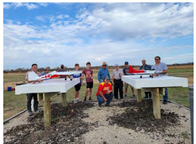
Tables in place with PVC tops installed, and a proud work crew looking on.