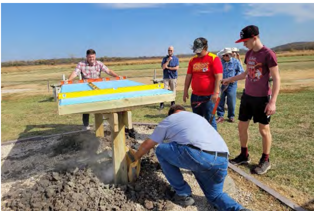
Cementing the first table in place (despite how this looks, the table really IS level).