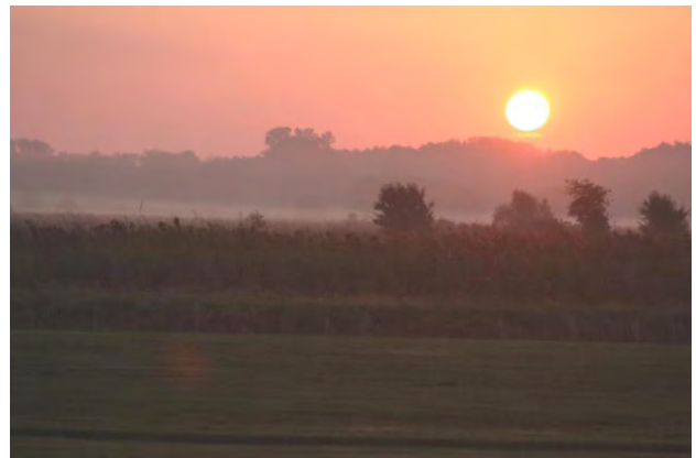
Here was our field seen from Clinton Dam

We had an absolutely beautiful day that started with some interesting ground fog and an incredible sunrise seen here: