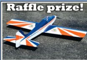
Raffle prize! Nexa Taipan ARF 62" WS