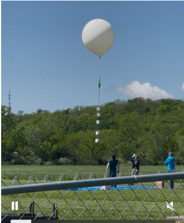
Weather balloon launch at our field.

Most photos (all the good ones) by Vern Nelson