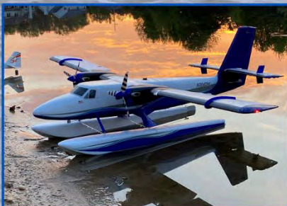
E-flite Twin Otter 1.2m BNF, With FLOATS!

Bloomington East Campground, Boatramp #7, Clinton Lake Pilot Registration 8:00a. Floating Fee $10. Flying from 9:00a to 3:00p.